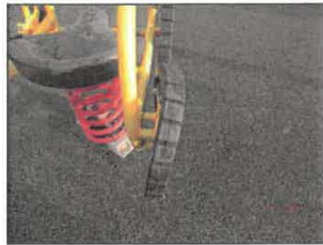
(Distorted wheel – library photo)