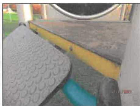
(Potential foot trap)