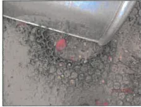
(Damaged grass mat)