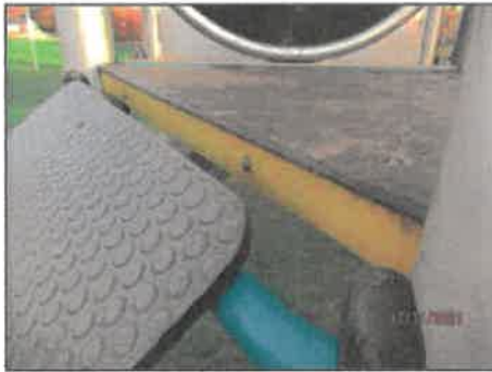
(Potential foot trap – library photo)