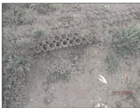
(Potential trip hazard at edge of mat)