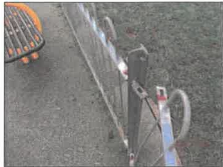
(Missing fence bolt)