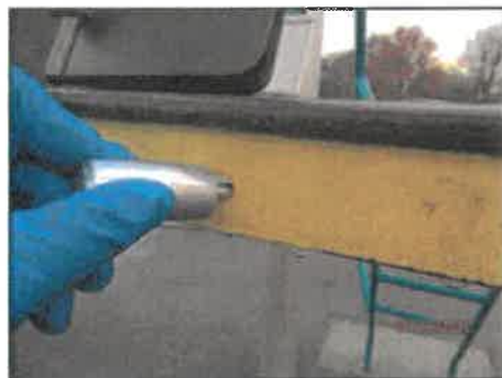
(Potential finger traps at missing bolts)