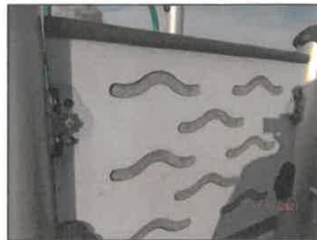
(Missing bolt cover caps)