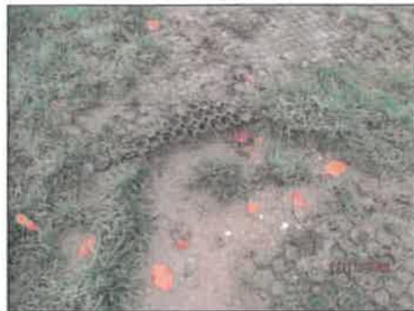
(Potential trip hazard at edge of mat)