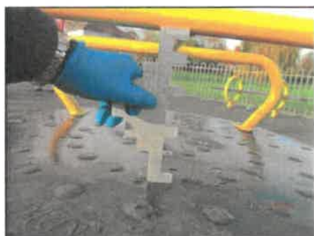
(Potential head trap – library photo)