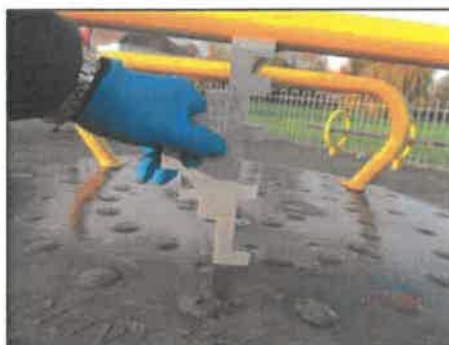
(Potential head trap)