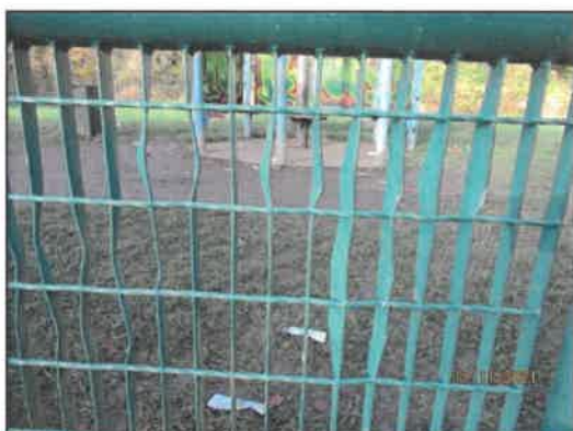
(Slight damage to mesh panel – library photo)