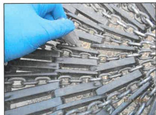
(Potential finger trap – library photo)