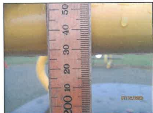
(Potential head trap)