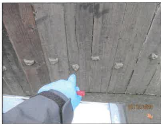
(Loose foot hold)