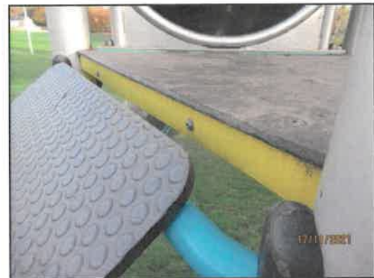
(Potential foot trap – library photo)