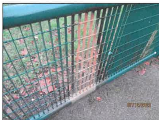
(Slight fire-damage to panel)