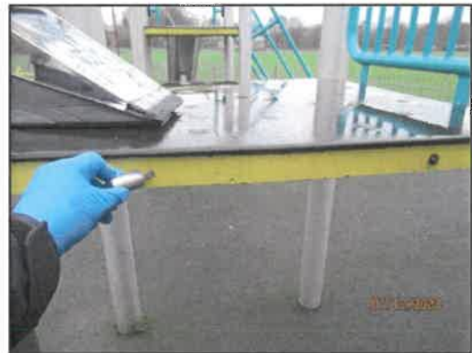
(Potential finger trap at missing bolt)