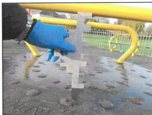
(Potential head trap – library photo)