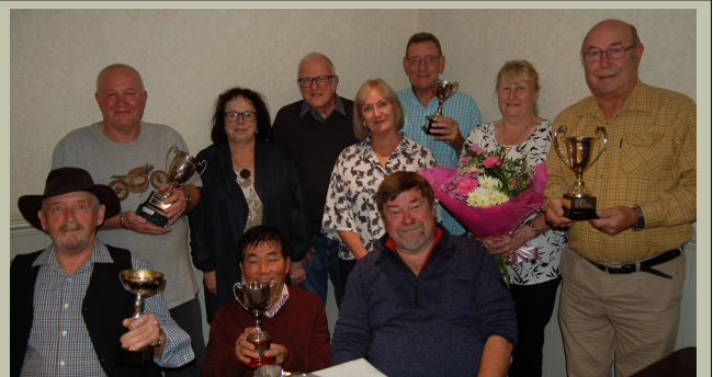
The worthy winners with their trophies